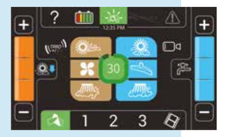
ec-H2O<sup>™</sup> equipped with the Severe Environment<sup>™</sup> switch allows users to benefit from detergent-free cleaning and access on-board chemicals for soils ec-H2O was not designed to clean.