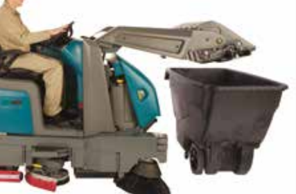
Powered High Dump