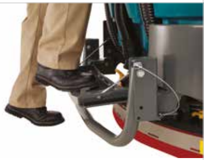
Recovery Tank Access Step