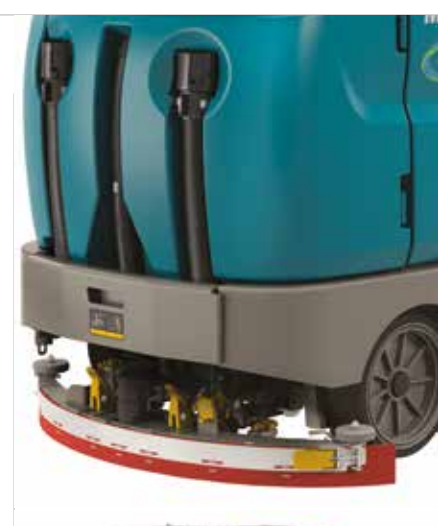
Spray hose makes machine spray-down and cleanup quick and easy.